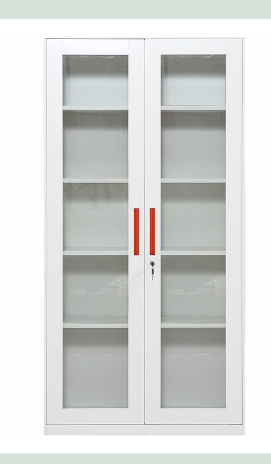
Medical Storage Cabinet