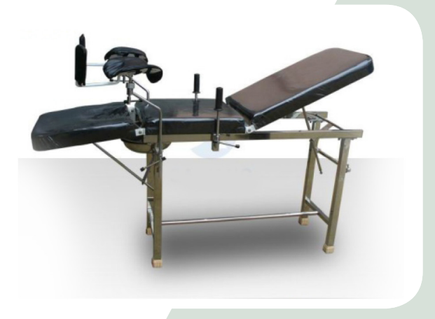
Standard Delivery Bed