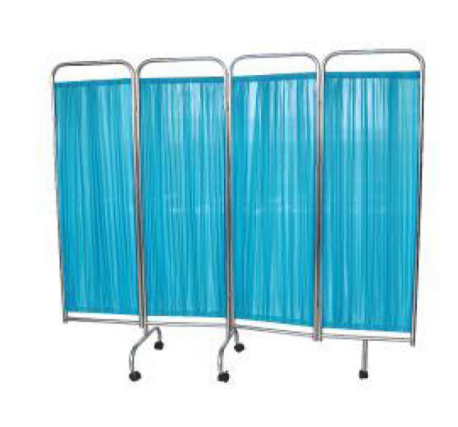
Patient Ward Screen