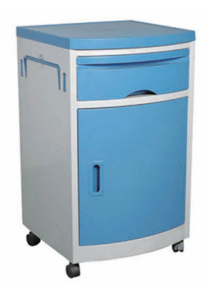
Blue Bed Sidecabinet